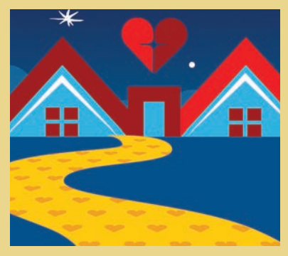
Save the date for next year, "Follow Your Heart to Mis" Nov. 2, 2024.