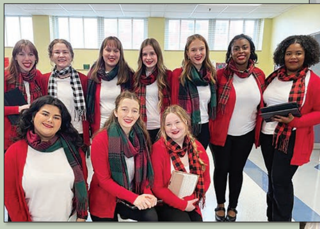
The Mother McAuley Liberal Arts High School A Cappella Choir had a great visit to Misericordia to spread Christmas Cheer to our residents!